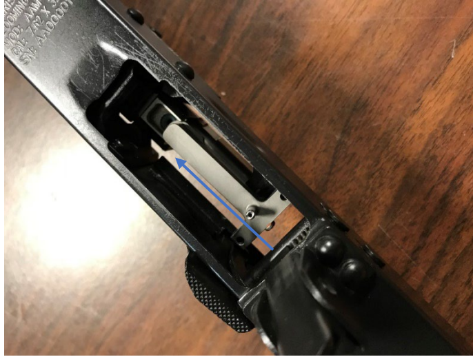
Figure 3: Tailpiece Installation 1