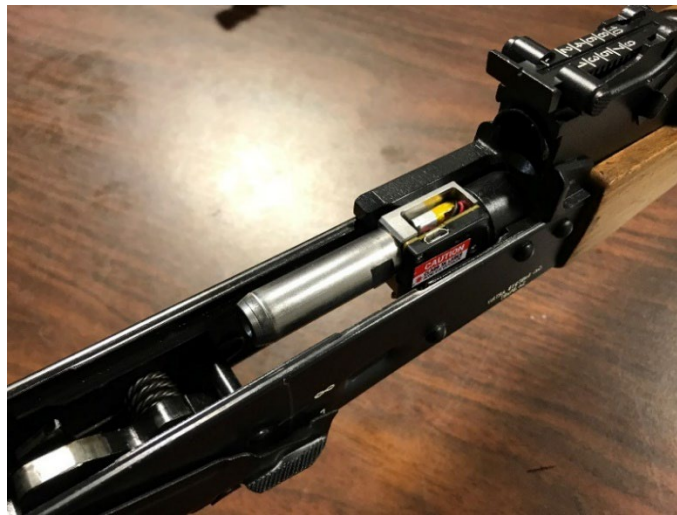
Figure 2: Charge Chamber Installation