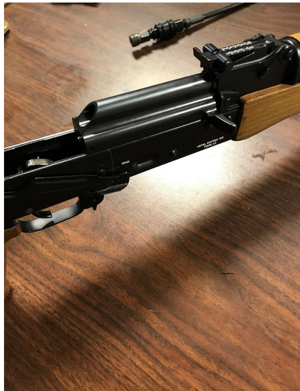
Figure 6: Bolt Carrier Fully Installed