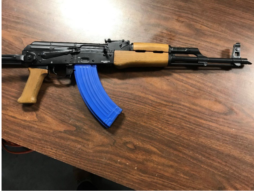
Figure 11: Finished Installation