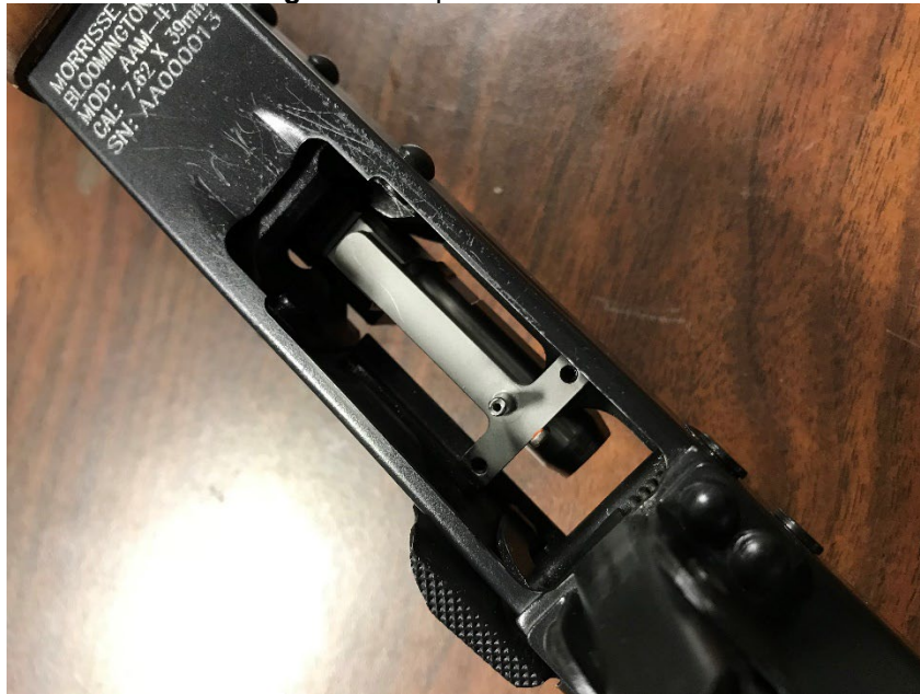
Figure 4: Tailpiece Fully Inserted