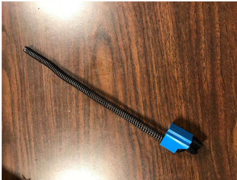
Figure 8: Recoil Spring and Buffer