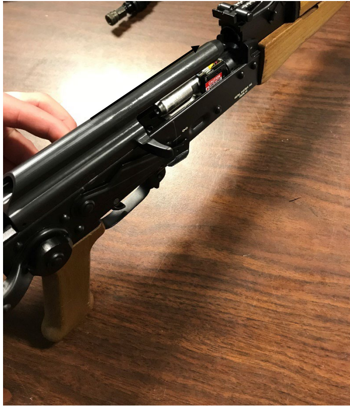
Figure 5: Bolt Carrier Installation 1