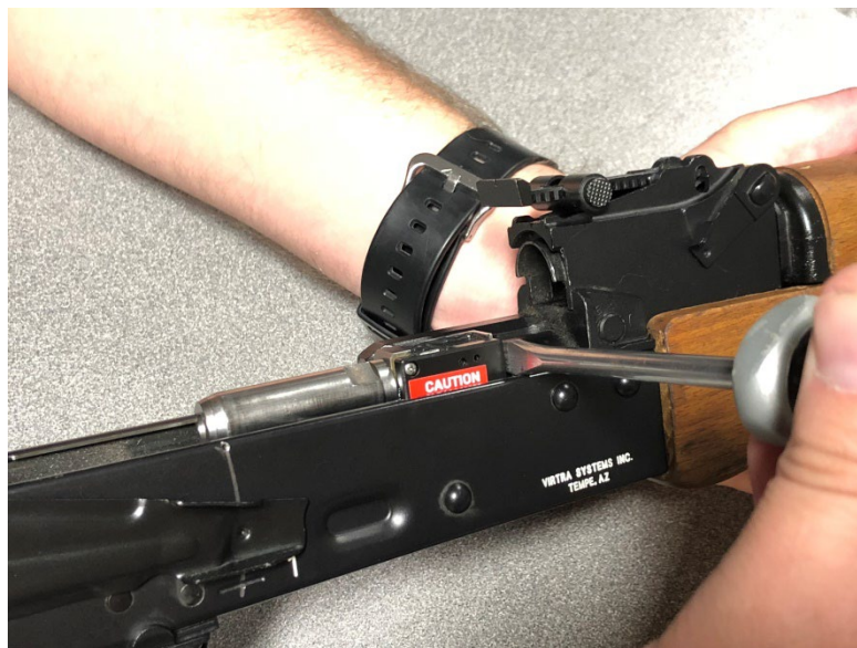
Figure 12: DO NOT PRY AT THIS LOCATION

WARNING: When removing the Charger Chamber, Do Not pry on, or put any pressure on, the circuit board or cover. Doing so may result in damage to the board and render the recoil kit un-useable. See Figure 12 and 13 for where NOT to pry. See Figure 14 for an acceptable spot to pry against metal.