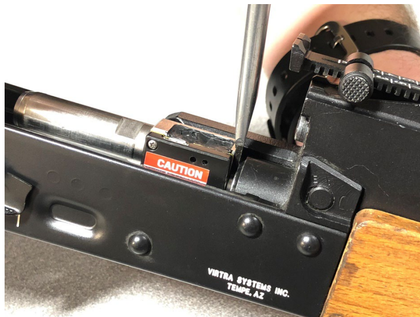
Figure 14: Approved spot to pry on metal.