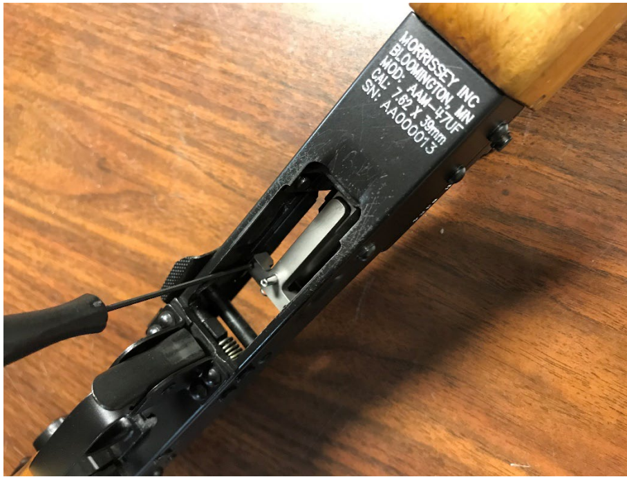
Figure 7: Tailpiece Adjustment