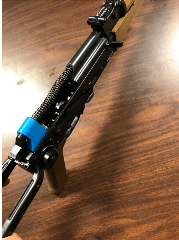
Figure 9: Recoil spring and Buffer Installation

WARNING: Failure to install the Recoil Buffer may result in damage to the Bolt Carrier Assembly as seen in Figure 10.