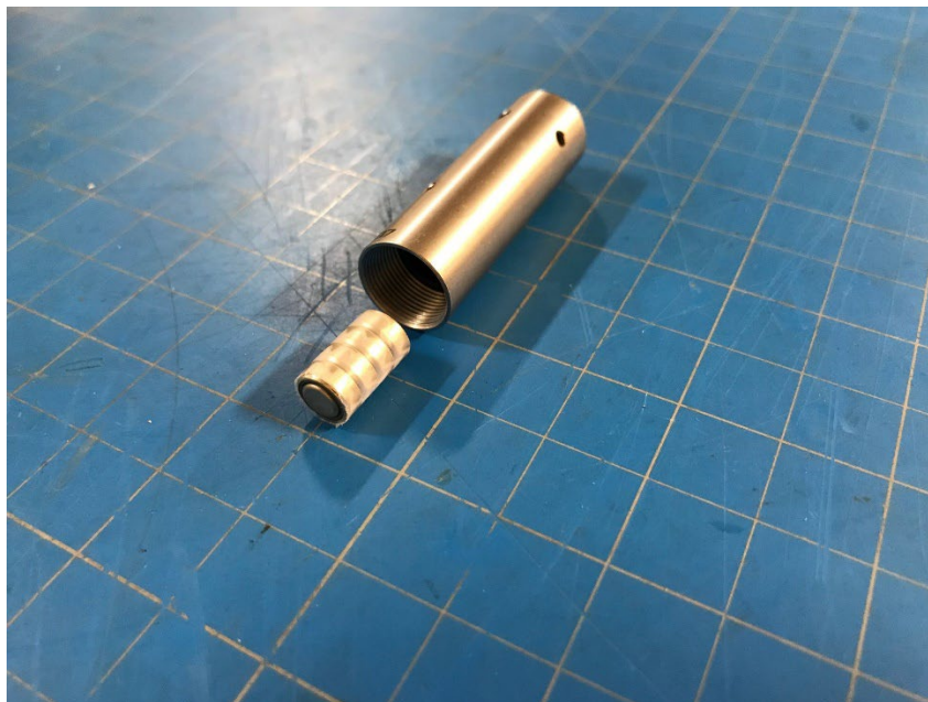
Figure 5: Battery Installation