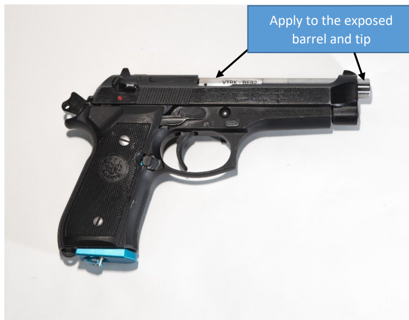
Figure 3: Lubrication