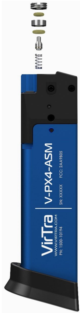
Figure 1: Magazine Assembly