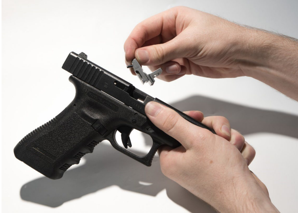
Figure 7: Tailpiece Install