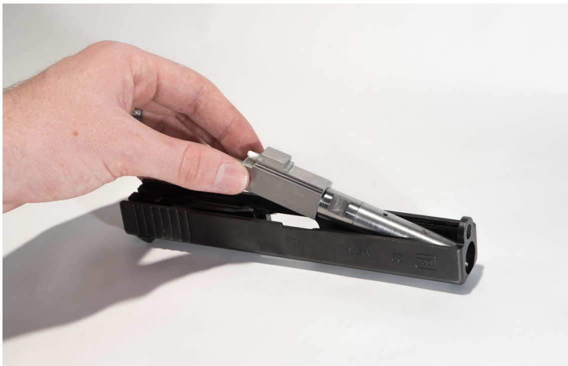
Figure 3: Barrel Assembly Install