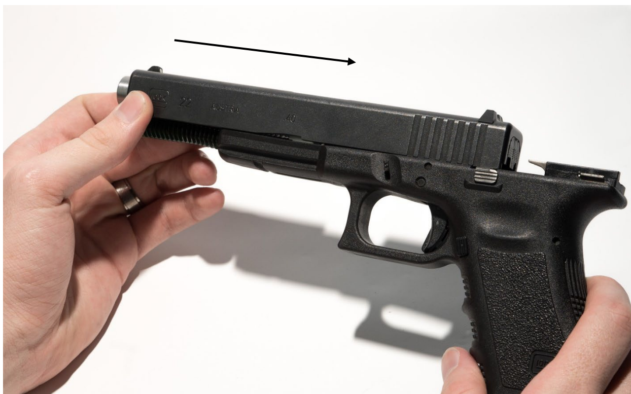
Figure 6: Handgun Frame Install