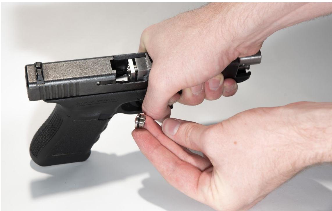
Figure 9: Tailpiece Fastener Install 1