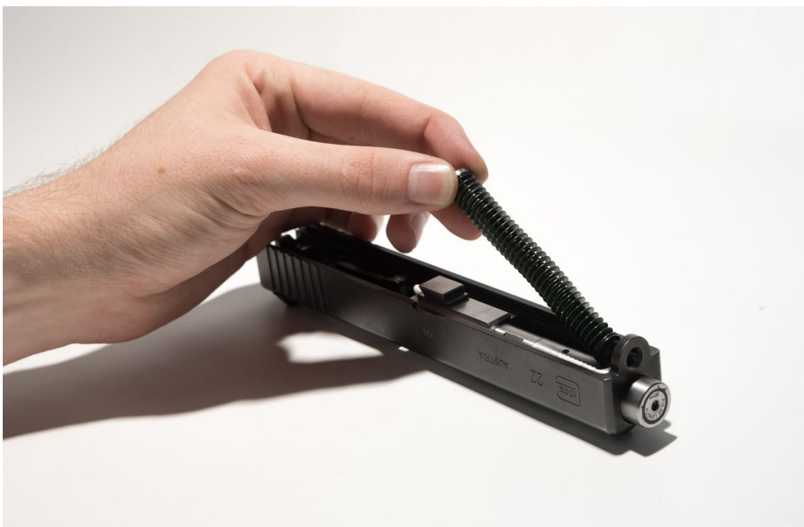
Figure 4: Recoil Spring Install