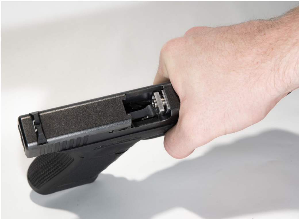
Figure 8: Completed Tailpiece Install