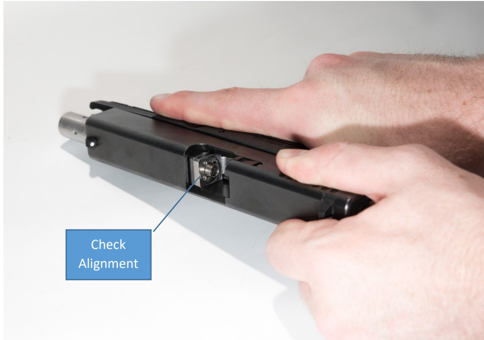
Figure 11: Alignment Check