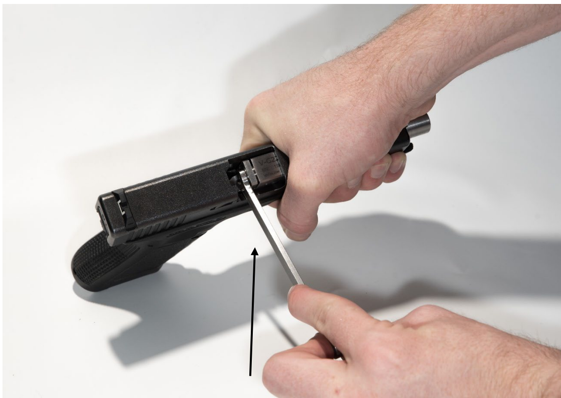
Figure 10: Tailpiece Fastener Install 2