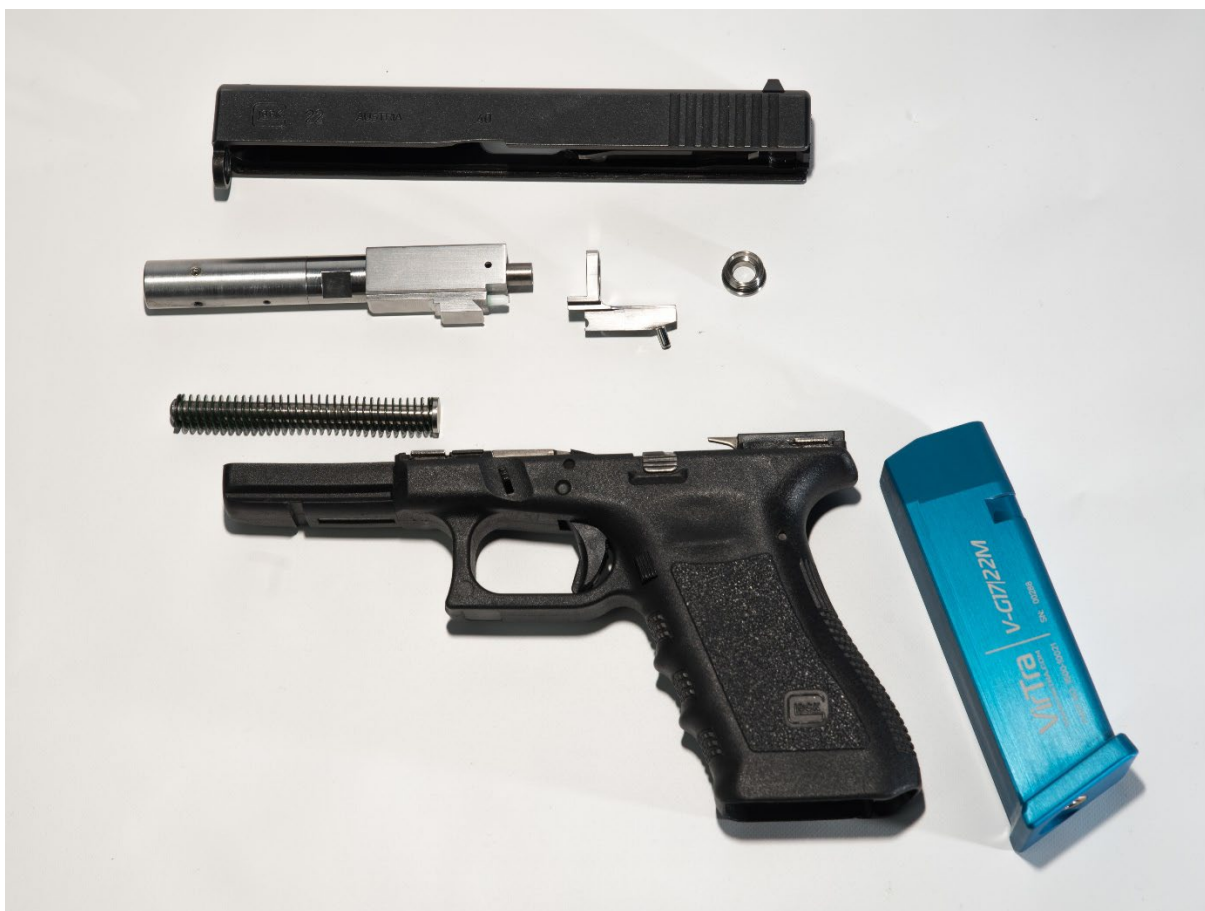
Figure 2: Kit Components