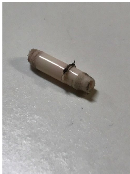
Figure 7: Damaged Air Tube

Inspect the air transfer tube (Figure 1, #15) once a month. If any excessive wear or damage is noticed then it should be replaced. Refer to the picture below of a worn air transfer tube.