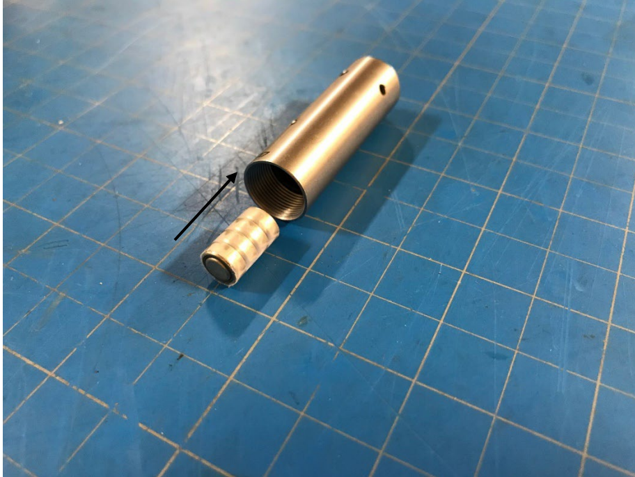
Figure 8: Battery Installation