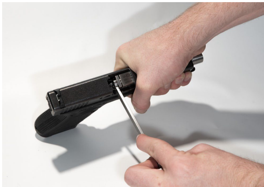
Figure 5: Tailpiece Tightening