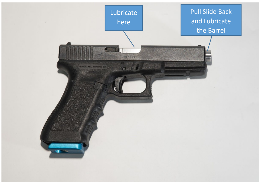
Figure 3: Ejection Port and Barrel Lubrication