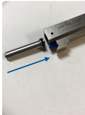
Figure 6: Piston Lubrication