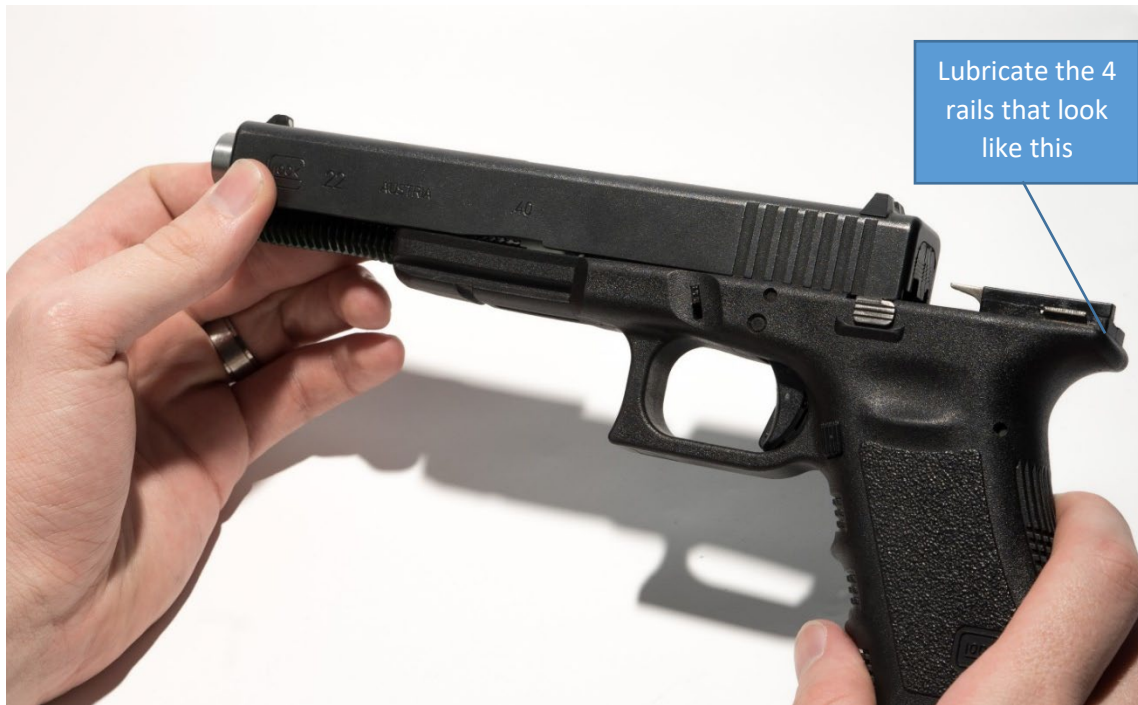
Figure 4: Tail Lubrication